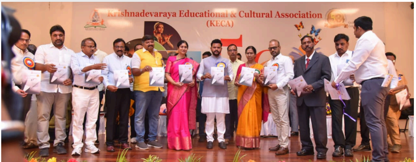
Launching Golden Jubilee Brochure